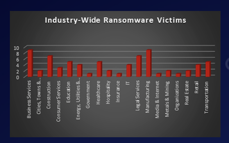
Figure 3: Industry-wide Ransomware Victims