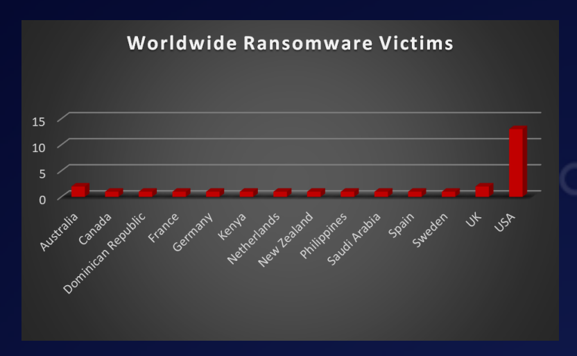
Figure 2: Ransomware Victims Worldwide