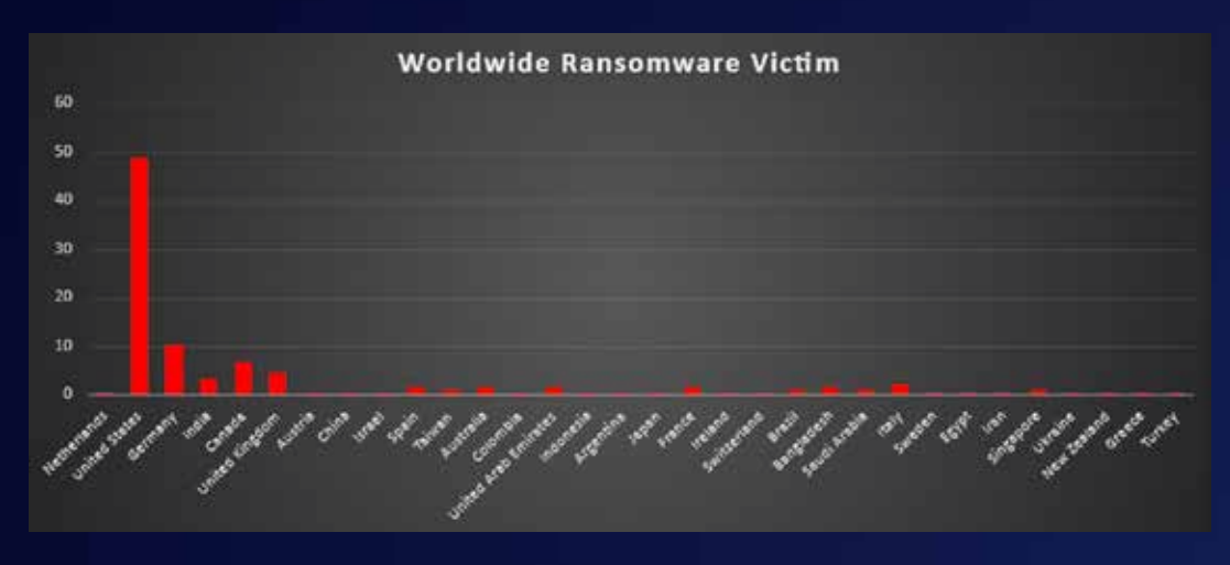
Figure 3: Ransomware Victims Worldwide

This global distribution of ransomware incidents underscores the widening scope and international scale of cybercriminal operations. The findings highlight the urgent need for coordinated cybersecurity efforts, including cross-border intelligence sharing, robust threat detection capabilities, and resilient incident response plans to mitigate the escalating risk posed by ransomware threats.