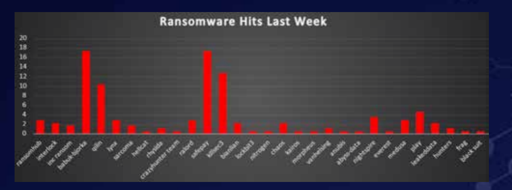
Figure 1: Ransomware Group Hits Last Week